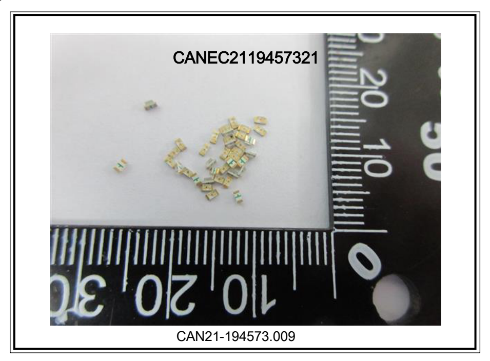
SGS authenticate the photo on original report only